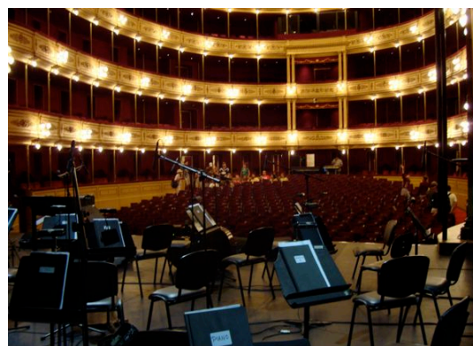
Teatro Solis, Montevideo, Uruguay