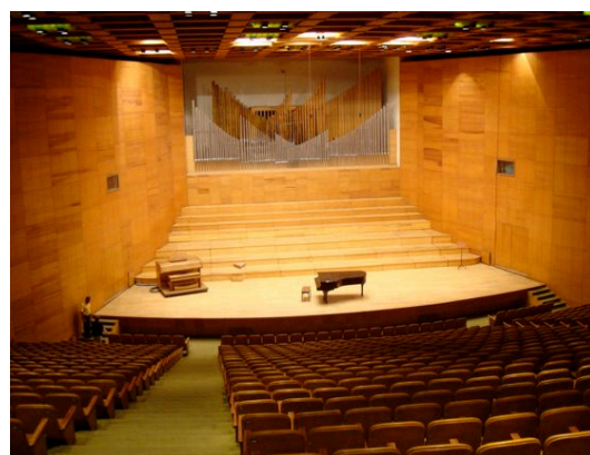
Mozarteum, San Juan, Argentina