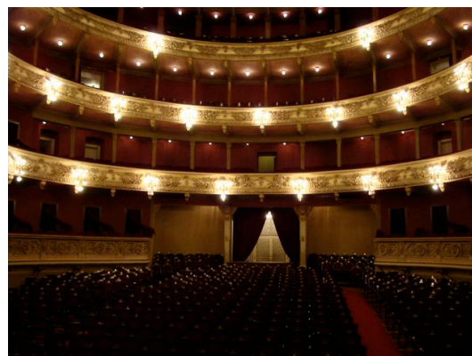
Teatro El Circulo, Rosario, Argentina