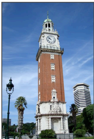
The English Clock Tower in Buenos Aires