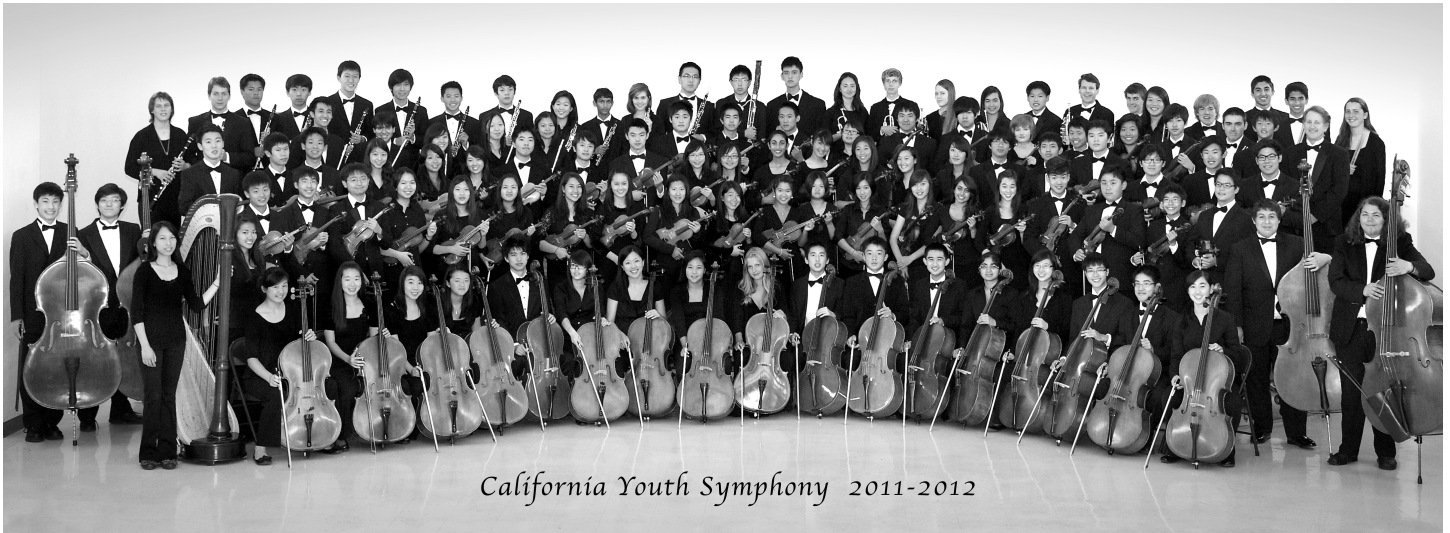
California Youth Symphony 2011-2012