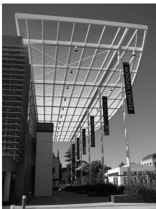
Mondavi Center for the Arts